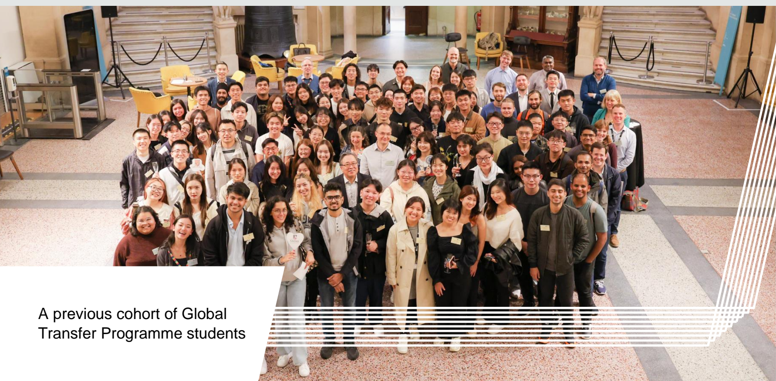
A previous cohort of Global Transfer Programme students